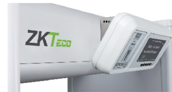
◀ Metal bracket