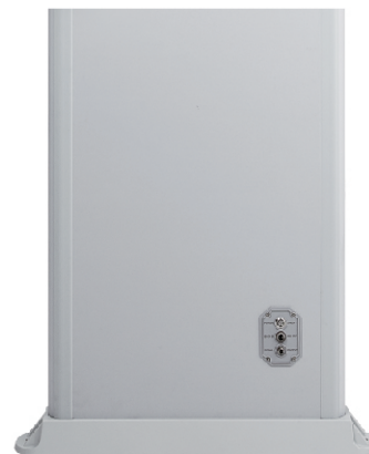
◀ Power supply and linkage interface