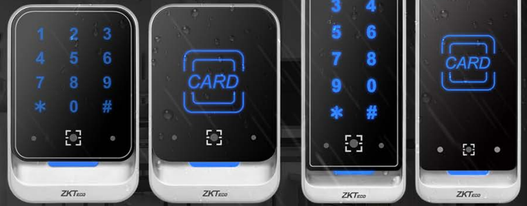
QR600 - HK