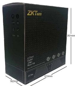
(Come kit - 3.9kg) / (Bullet kit - 4.1kg)