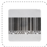
RFtag1 RF Soft tag 40*40(mm) Detection Distance: 1.2 m