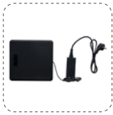
RF-769B RF Deactivator