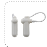
RFtag6 Tag with Lanyard Detection Distance: 1.2 m