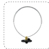
RFtag5 Milk Can Tag Detection Distance: 1.3 m