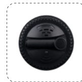
RFtag7 Spider Tag Detection Distance: 1.3m