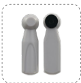
AMtag2 Small Pencil Detection Distance: 1.4-1.7m