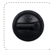
AMtag5 Spider Tag Detection Distance: 1.7-2.0m