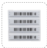
AMtag1 AM Soft tag Detection Distance: 1.2-1.5m