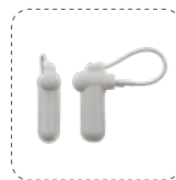
AMtag4 Tag with Lanyard Detection Distance: 1.2-1.5m