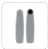
AMtag3 Big Flat Pencil Detection Distance: 1.9-2.2m