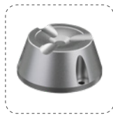
EAS-D10N: Universal Detacher 10000GS