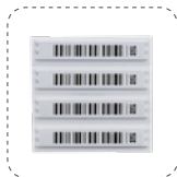
AMtag1 AM Soft tag Detection Distance: 1.2-1.5m