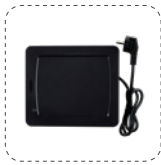
AM-D886: AM Deactivator