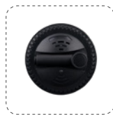
AMtag4 Tag with Lanyard Detection Distance: 1.4-1.6m