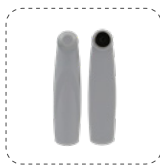
AMtag3 Big Flat Pencil Detection Distance: 1.8-2.2m