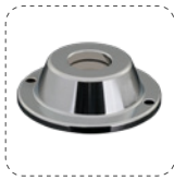
EAS-D01: Normal Detacher 4500GS