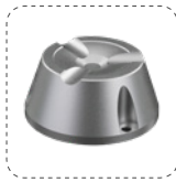
EAS-D10N: Universal Detacher 10000GS