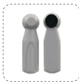
AMtag2 Small Pencil Detection Distance: 1.4-1.7m