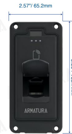
EP30CF (Without metal Case)