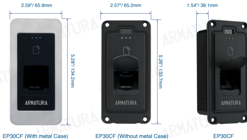
EP30CF (With metal Case)