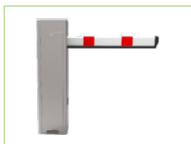
PB Series Automatic Barrier