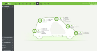
ZK Parking C/S