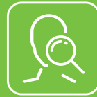
Touchless for Better Hygiene