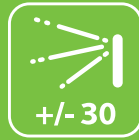
Wide Pose Angle Acceptance