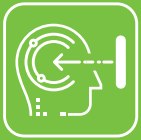
Proactive Facial Recognition