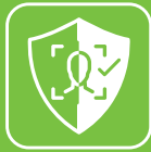
New Height of Anti-Spoofing